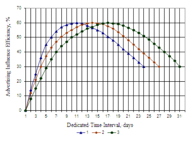
Curve 1. Advertising efficiency at advertising price c_1 and money terms of one unit of advertising efficiency k_1 ;

Curve 2. Advertising efficiency at advertising price c_2 and money terms of one unit of advertising efficiency k_2 ;